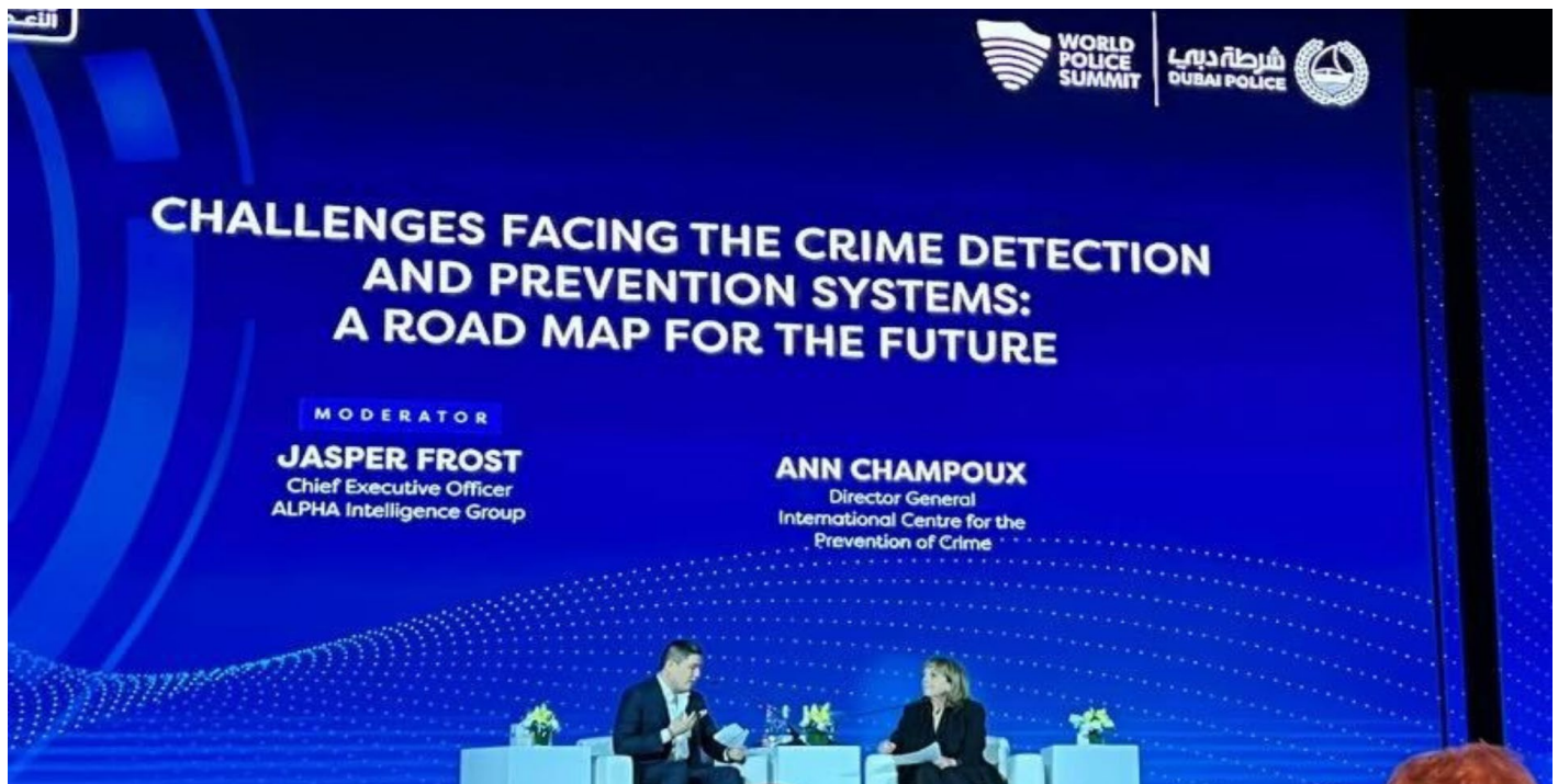
March 7-9 mars, 2023: Participation in the World Police Summit in Dubai, United Arab Emirates